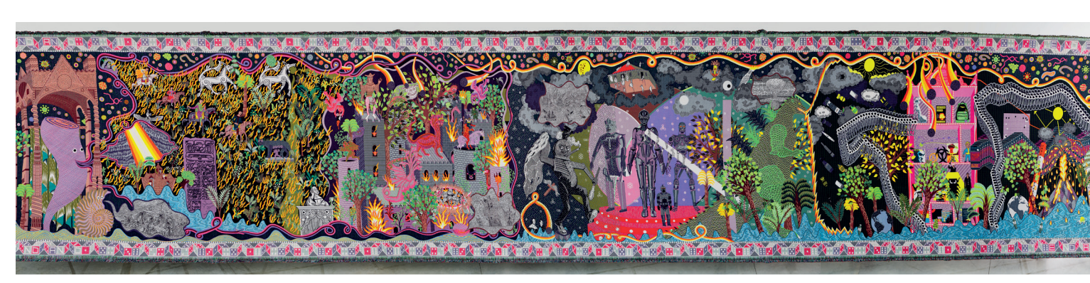
« end and », exhibition view at CCCOD, Tours, France, February 2025 @ Aurélien Mole