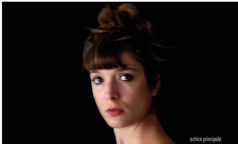
Index 3 (2025) , full HD 16/9 digital slideshow, double projection (English / French), silent, duration 47 min.